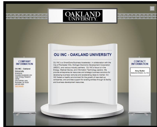
Oakland University -- 2015 Silver Sponsor

OU INC is a SmartZone Business Accelerator, in collaboration with the City of Rochester Hills, Michigan Economic Development Corporation (MEDC), and various industry partners. OU INC's focus is in the Energy, Medical Device, and Information Technology sectors. They provide entrepreneurial resources and strategic business solutions for developing business ventures and accelerating ideas to market. OU INC fosters a healthy environment for the growth of new start-up companies, and provides support for existing entities through its facility and business development resources.